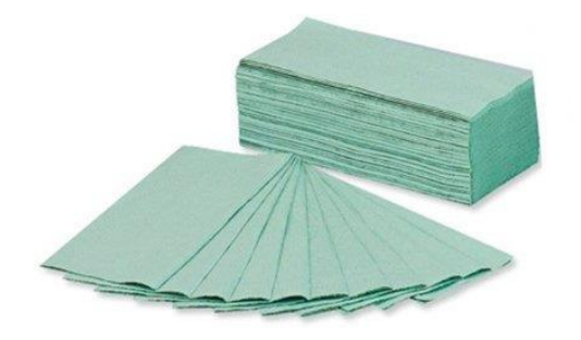
Try to use 1 paper towel to dry your hands.