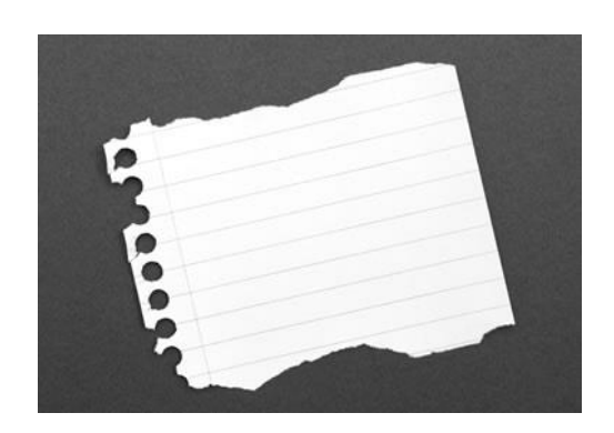
Saving any scrap paper!