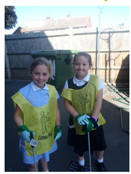
Throw your rubbish in the bin so our litter pickers do not need to pick it up!