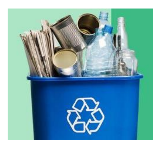
Recycling as much as we can!