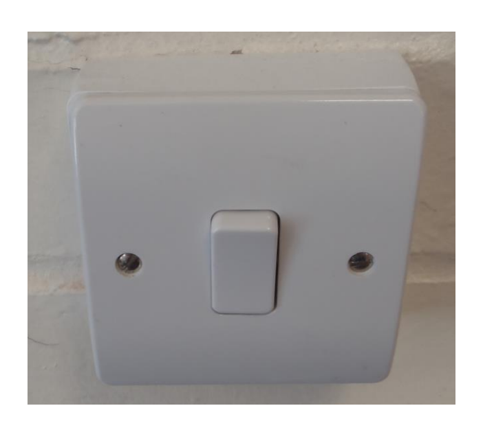
Switching lights off when we leave the classroom.